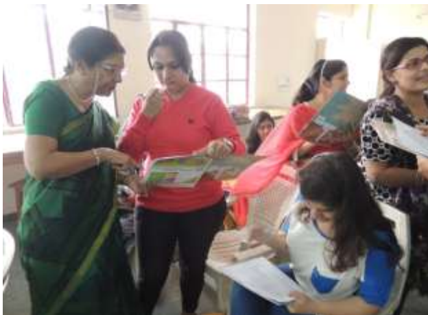
Engaged & Engrossed