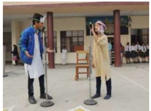
Teaching Honesty is the Best Policy