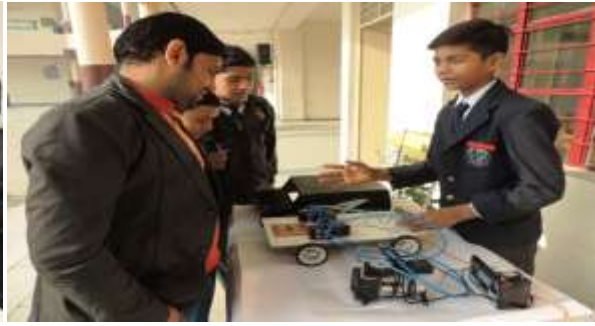
The most lauded exhibit