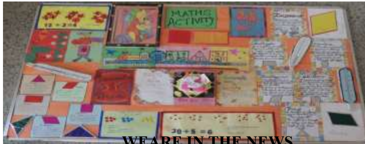
WE ARE IN THE NEWS