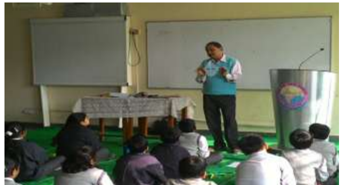
LEARNING TO SHARPEN SKILLS